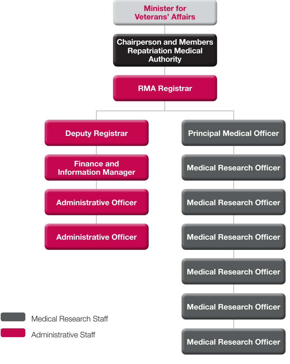
Appendix 1: RMA Secretariat staffing structure

Note: A number of the positions are staffed on a part-time basis.